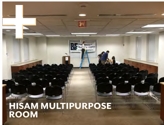
HISAM MULTIPURPOSE ROOM

***Sculpture Garden Available for $500 with Options 1 or 2