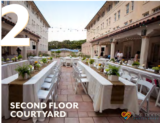
SECOND FLOOR COURTYARD

The tranquil yet dramatic open-air Courtyard overlooks the HiSAM Sculpture Garden. In the evening, the Courtyard is lit by sconces and hanging fixtures. The Courtyard is suitable for receptions or parties.